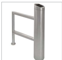
SWB_RL railing with built-in IR sensor